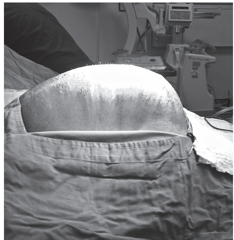
Figure 3 – In the operating room.

Such findings closely correlate with encapsulated waterlike fluid, in this case seroma. This probably accounts for the long-standing nature of the lesion. Surgical excision with complete resection of cyst had been performed (Figure 3). Cyst was filled with serous fluid and had thin capsule. During the operation, cyst was resected with capsule and sent to histopathology department. The wound was closed with simple multilevel interrupted sutures. Vacuum drainage