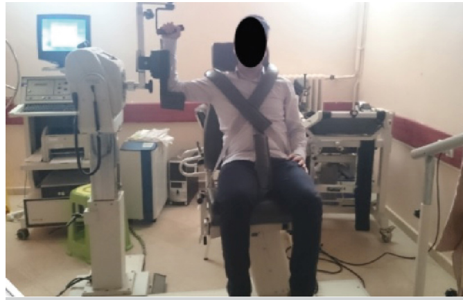
Figure 3. Isokinetic muscle power analyzes.

stabilizer bands. The elbow was placed in the elbow attachment of the device with the shoulder abducted at 90 degrees and elbow flexed at 90 degrees. The height of the dynamometer was adjusted according the axial center of the shoulder rotation. A correction factor was used for the gravity. Patients were provided information on the nature of the test and the exercise, and were asked to push and pull the effort arm as forcefully and quickly as possible. Initially exercise using three different angular velocities were performed in the concentric-concentric mode at 60 degrees/sec, 120 degrees/ sec, and 180 degrees/sec (with three submaximal movements for warming up before the exercise). This was followed by three internal and external rotation movements at maximal force. For 90-degree ROM distance, the long axis of the forearm was at right angle to the ground surface at the start and fully parallel at the finish of the exercise during internal rotation, and during external rotation, the long axis was switched from a position fully parallel to the horizontal line to a position at right angle. Between each angular velocity, the intact side (control side) was allowed to rest for 2 minutes. For both upper extremities, peak torque/bw (maximal muscular power/weight in kg) corrected for weight was estimated. The percent deficit between the intact site and the fractured site was used for study analyses.