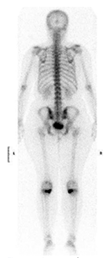
Figure 2. A scintigraphic view showing increased activity at bilateral proximal tibia.

At four months of follow-up, the patient was asymptomatic and MRI of both knees showed significantly decreased bone marrow edema compared to the previous imaging and an incomplete fracture line at the medial sides of bilateral proximal tibia. Partial rupture of the anterior cruciate ligaments was