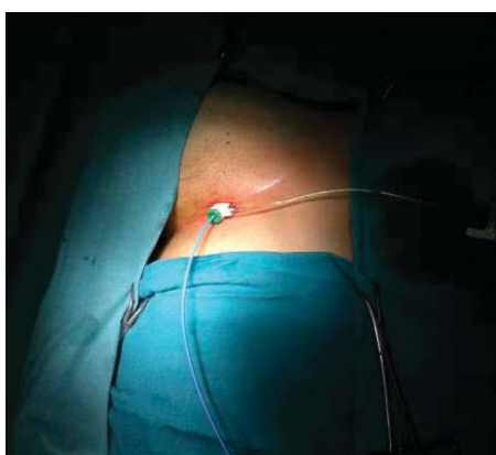
Figure 2. Pericardiocentesis via the right parasternal approach.

approach was chosen. Echocardiography-guided pericardiocentesis was performed under local anesthesia in the operating room owing to the increased risk for pneumothorax. A puncture needle was advanced through the sixth intercostal space at the right parasternal border, and nearly 600 mL of hemorrhagic fluid was aspirated (Figure 2). After pericardiocentesis, the patient's vital signs were as follows: pulse rate 85 beats/min, respiration rate 19 breaths/min, body temperature 37.5°C, and blood pressure 115/75 mm Hg. A very small amount of pericardial effusion was seen during TTE. The fluid cytology was compatible with metastatic disease. She died from respiratory failure three months after the procedure. Pericardiocentesis via the right parasternal approach can be used in a patient with severe comorbidity.