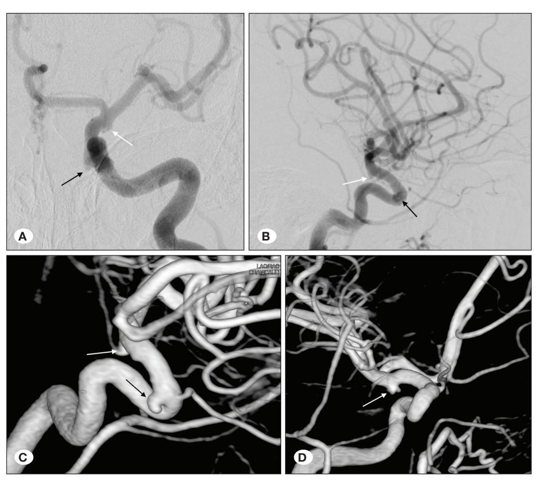
Figure 1: A 49-year-old patient suffering from headache was evaluated with digital subtraction angiography and 2 small aneurysms (A-D) of the left internal carotid artery ophthalmic segment (black arrows, A-C) and anterior choroidal artery (white arrows, A-D) were seen.