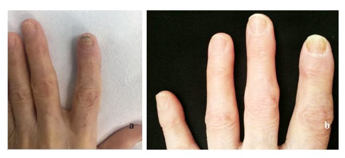
Figure 3: The clinical photograph of a nail (thumb) treated with methotrexate a-before the study and b-at month 4

<sup>c</sup>Pearson chi-square test, <sup>d</sup>Fisher- Freeman-Halton test, <sup>e</sup>McNemar test, <sup>*</sup>p<0.05, <sup>**</sup>p<0.01, Mtx: Methotrexate, TA: Triamcinolone acetonite, SP: Serum physiologic