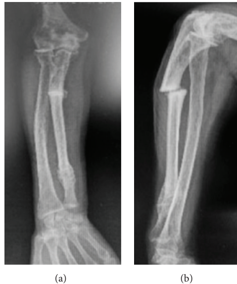
FIGURE 3: Forearm radiographs at the 6th week follow-up demonstrating the nonunion.

At the 4th week, long-arm cast was changed to short arm cast and continued for two more weeks. At the end of 6 weeks, the plaster cast was removed and the pain subsided, but there was no sign of bony union at the fracture site (Figure 3). The patient continued to deny the operative treatment. After the last visit at the 6th week, the patient was lost to follow-up.