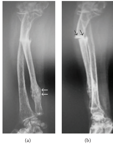
FIGURE 1: Anteroposterior (a) and lateral radiographs (b) of the patient's forearm at initial admission. Black arrows show the atypical fracture line. White arrows show the previous healed fracture.