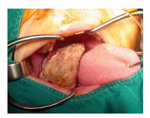
FIGURE 2: The preoperative examination showed a mass of the right retromolar area with a diameter of 7 \times 6 \times 4 cm extending deeply from the posterior ridge of the left lower alveolar process and gingivobuccal sulcus.

patient had interferon- \alpha therapy 3 times between the ages of 11 and 14. The family history of the patient was positive for NF1. His mother had documented NF1 with multiple neurofibromas and café-au-lait spots.