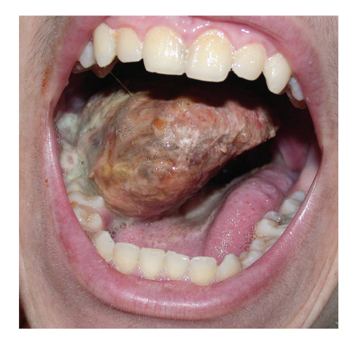
FIGURE 1: Oral examination showed a mass with nodular tissue causing severe dysphagia and respiratory distress.