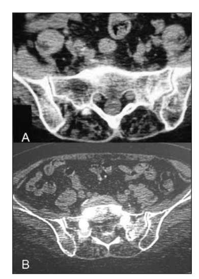
Figure 4: Preoperative and postoperative CT images of case 3: A: Preoperative axial CT view shows left sacral fracture and osteoporotic changes in the right sacral wing. B: Postoperative CT image shows the cement in the sacral wings.

aspects of the procedure have also been the subject of various studies together with clinical studies in recent years (25).