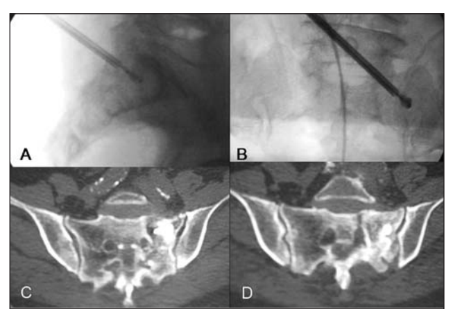
Figure 2: Postoperative radiological images of case 1. ( A , B ): show the lateral and AP view of the sacroplasty procedure under fluoroscopy with C-arm. ( C , D ): Postoperative appearance on CT slices