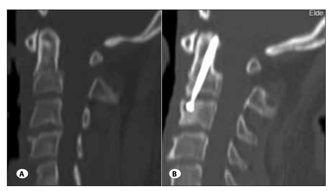
Figure 3: A) Preoperative and B) postoperative 6<sup>th</sup> month CT showing the odontoid fracture type II and fusion (Group II).

Although our number of patients is limited and we need larger series, we think that the Ozer's anterior transodontoid screw fixation technique may help to increase the healing capacity of fractured sites of type II fracture. This technique may be chosen for the suitable patients for the fusion of type II odontoid fractures.