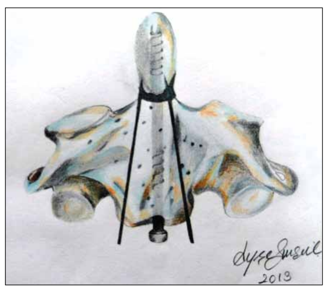
Figure 1: Illustration showing the technique of operation.

In 2009, Ozer et al. (4) reported a specific anterior transodontoid screw fixation technique for the management of chronic type II odontoid fractures. They created multiple holes in the sclerotic margins of the C2 body and the odontoid. These holes provided more contact points of spongious bone to