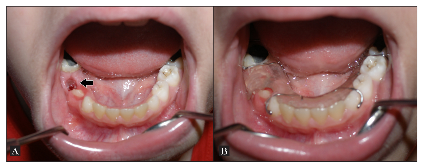
Figure 2: (A) Intraoral appearance of marsupialization cavity in left mandible after two weeks; (B) adaptation of the obturator to the orifice

Gurler, et al.: Conservative surgical treatment of jaw cysts