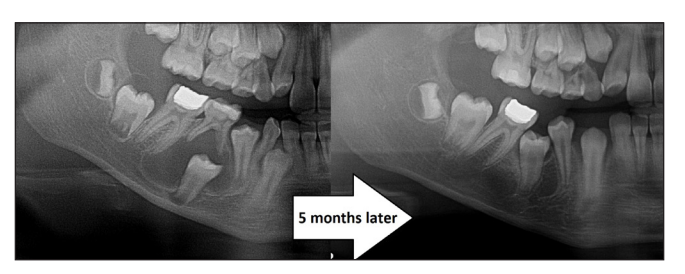
Figure 4: Resolution of the cystic lesion and eruption of the impacted tooth after marsupialization