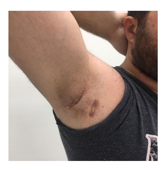
Figure 3. Atrophic scar areas on the right axillary area at 6 months

Before the treatment DLQI score was14.4±6.9 (range 7-21), but after the treatment DLQI score was found as: 4.3±3.8 (range 1-8) (p<0.05).Besides, before the corticosteroid treatment dermatology life quality index (DLQI) was found as 13.7±5.3 (range 7-21), but it was 11.3\pm2.1 (range 5-12) after the treatment. Before the systemic antibiotic use, DLQI score was 13.2±3.3 (range 8-21), but after the treatment; it was 10.1±2.4 (range 3-12) and before the retinoid use DLQI was recorded as; 14.7±5.2 (range 8-17) and after treatment as: 9.4±2.3 (range 3-11) (p>0.05). We also ascertained that after the treatment a consultation was made to a nutritionist for all patients and started on either a lower fatty diet or a specialized diet accepted for patients with diabetes mellitus and metabolic syndrome.