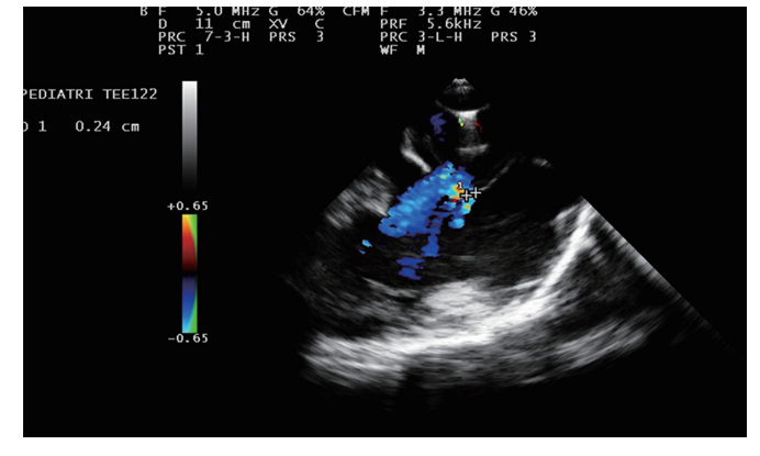
Fig. 2. Aneurysmatic septum and three defects at bicaval position on transesophageal echocardiography in a 10-year-old female patient performed balloon septoplasty.

In Group 2, a 14-year-old patient received an ASO home-made fenestration due to pulmonary hypertension. In this patient, the defect diameter at TTE was 19 mm, color flow diameter was 25 mm, pulmonary artery pressure was 54/11 (average: 37) mmHg, Qp/Qs: