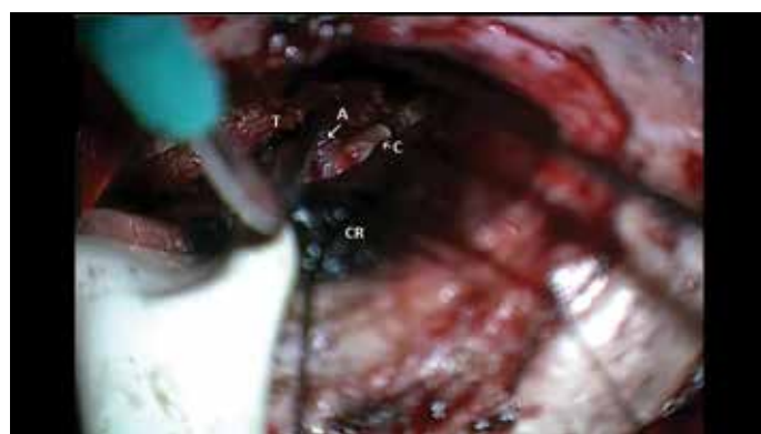
Figure 3. Intraoperative image that shows the arachnoid adhesions between the tumor and cochlear nerve. T: tumor, A: adhesions, C: cochlear nerve, CR: cerebellum

the caudal portion of pontocerebellar area and jugular foramen with some extension to the neck on the left side. MRI was suggestive of schwannoma with sharply demarcated configuration and low T1 and high T2 signal intensity (Figure 2).