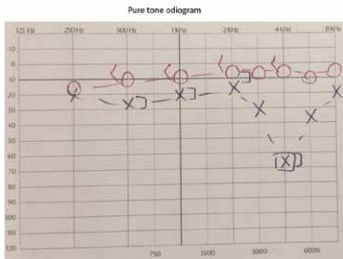
Figure 1. Pure tone audiometry and speech discrimination findings.