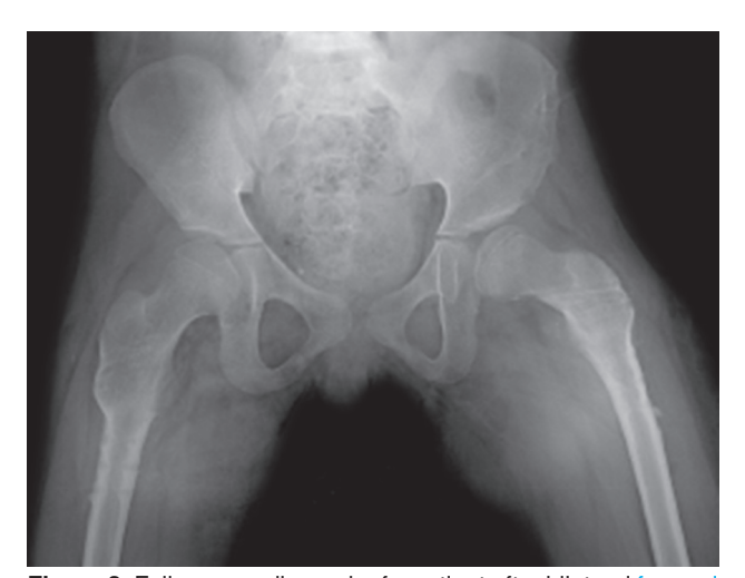
Figure 3. Follow-up radiograph of a patient after bilateral femoral varus derotation osteotomy and Dega transiliac osteotomy.