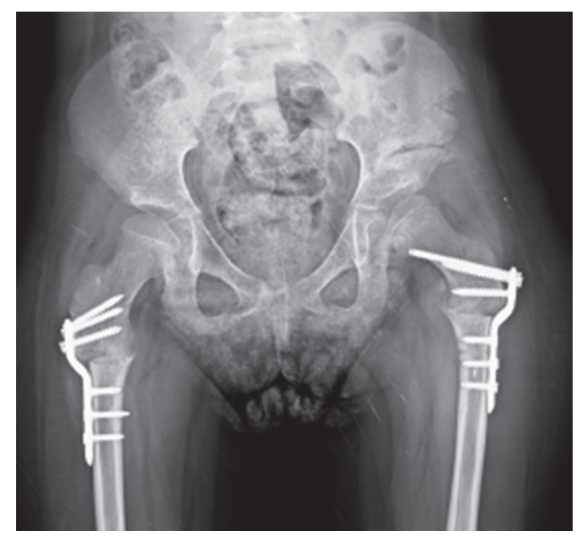
Figure 2. Postoperative radiograph of a patient after bilateral femoral varus derotation osteotomy and Dega transiliac osteotomy.

All patients were treated with femoral VDRO with Dega transiliac osteotomy as part of single event multilevel surgery. Femoral VDRO was performed at the level of lesser trochanter. All osteotomies