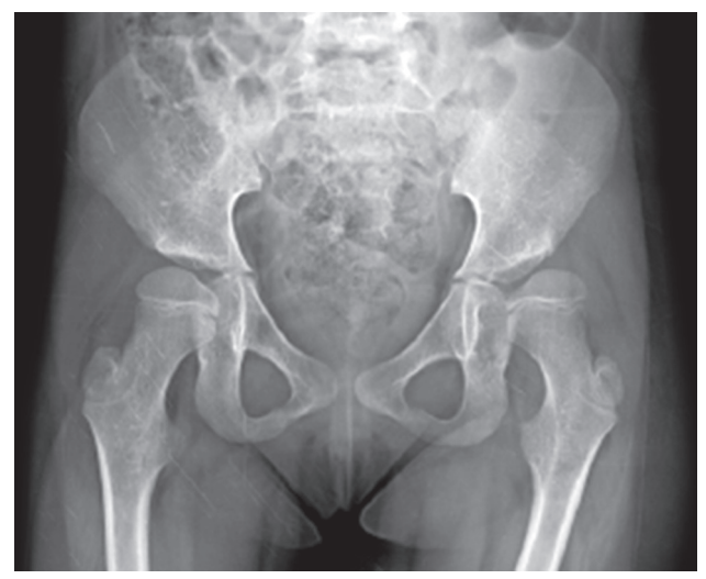
Figure 1. Preoperative radiograph.