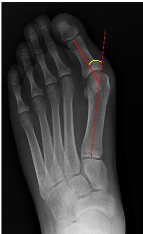
Fig. 1. Plain radiograph showing hallux valgus angle of the first metatarsal.

The surgical technique used for both study groups was the same except that different implants were used, as described. The chevron osteotomy was performed in both groups through a medial longitudinal incision starting from the base of the proximal phalanx and extending 5 to 7 cm proximally to the metatarsal head. The subcutaneous tissue and bursa were dissected, and the capsule of the joint was identified. The capsule of the joint was incised in a Y-shaped fashion, and a straight longitudinal incision was continued out to the bone. The toe was then adducted, and a bunionectomy was performed using an oscillating saw. The medial eminence was removed, and the “V” osteotomy was performed with an angle of 50° to 60° between the cuts. After the osteotomy had been completed, the distal metatarsal head was slid laterally and