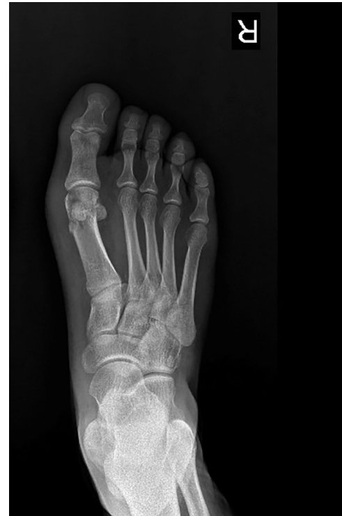
Fig. 5. Postoperative radiographs of a chevron osteotomy with bioabsorbable pins used for fixation.

surgery ( p < .001 , for both groups). This increase was also similar for both groups ( p = .119 ; Table 7 ).