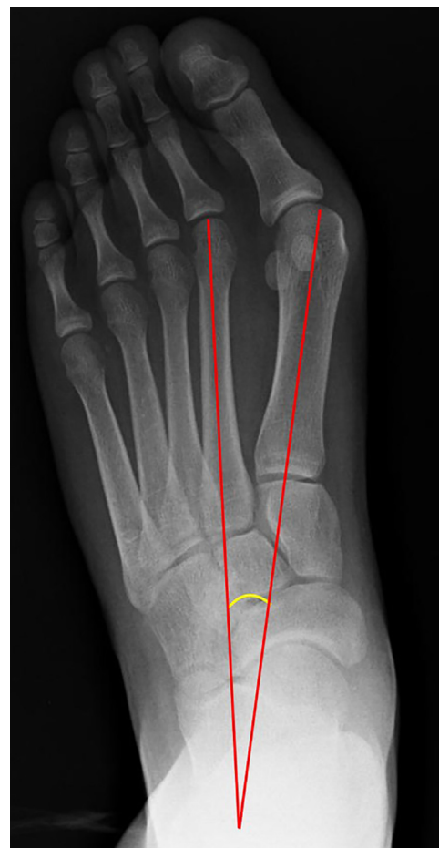
Fig. 2. Plain radiograph showing intermetatarsal angle of the hallux.

displaced 3 to 4 mm. Once this displacement was complete, the osteotomy site was first fixed with Kirschner wires, after which bioabsorbable pins composed of biodegradable copolymers L-lactide, D,L-lactide, and trimethylene carbonate (OTPS Biodegradable Pins, Inion, Tampere, Finland) or cannulated screws (Herbert headless cannulated titanium screws, TST Tibbi Aletler San., Istanbul, Turkey) were applied to hold the fragments in position (Fig. 4). Postoperatively, all operative feet in both groups were placed in a splint for ~3 weeks, and weightbearing on the first toe was not allowed until the seventh postoperative week (Fig. 5). No differences were found in terms of the surgical approach or postoperative management for the patients in either group.