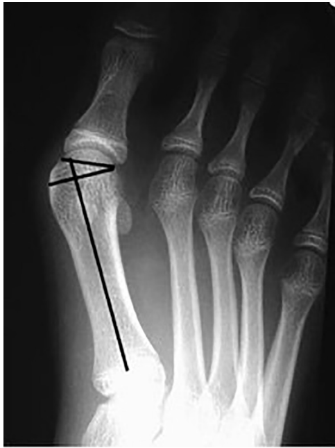
Fig. 3. A hallux valgus radiograph of a juvenile showing the distal metatarsal articular angle of the hallux.

no differences were found in any of these angles between the 2 groups. Postoperatively, a significant decrease in the HVA was observed in both the bioabsorbable pin and the cannulated screw groups, and the reduction was similar between the 2 groups ( p = .858 ). The IMA in the pin and screw groups decreased significantly after surgery compared with the preoperative measurements ( p < .001 , for both groups), and the reduction was similar for both groups ( p = .495 ). The DMAA in the pin and screw groups also decreased significantly postoperatively compared with preoperatively ( p < .001 , for both groups). Also, the reduction was similar for both groups ( p = .618 ; Tables 3–5 ).