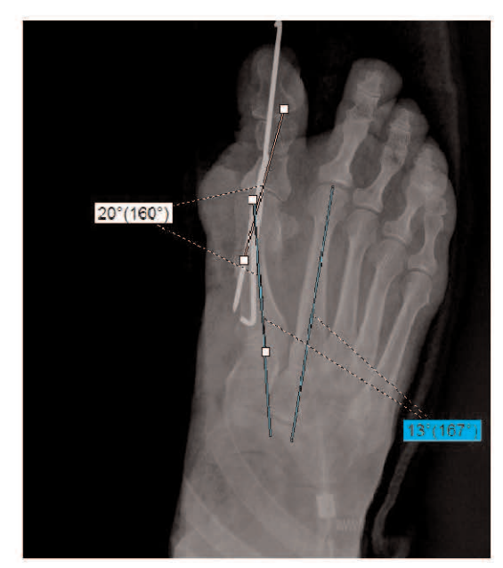
Figure 3 — Postoperative antero–posterior x-ray radiography of the same patient. The hallux valgus angle improved by 20° and intermetatarsal angle improved by 13°.