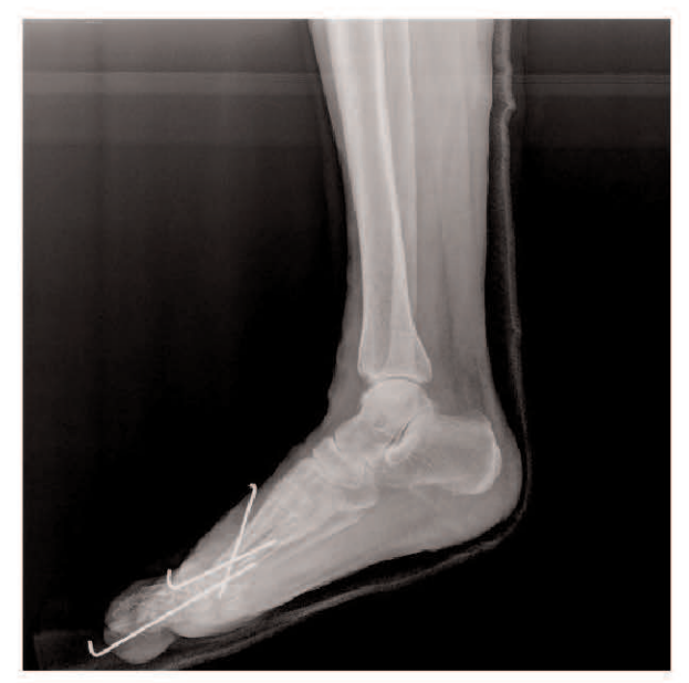
Figure 4- Postoperative lateral x-ray radiography of the same patient.

session. This scoring system consists of three main categories, namely pain, function, and alignment, scored from 0 to 100, with higher scores indicating better functions (10). The pain and function sections were answered by the patient.