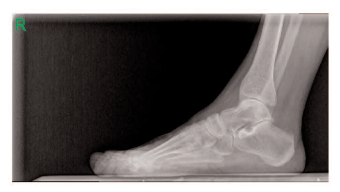
Figure 2 — Preoperative lateral weight-bearing x-ray radiography of a 62-year-old woman.