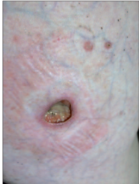
FIGURE 1a: A deep ulcer of 2x2 cm covered with a serous-purulent exudate on the right lower quadrant of the abdomen.

The dermatological examination revealed a deep ulcer of 2x2 cm covered by a serous-purulent exudate on the right lower quadrant of his abdomen (Figure 1a), a punched-out, painless deep ulcer of 0.5-1 cm on his right inguinal area and multiple ulcers on his medial bilateral gluteal areas (Figure 1b). There were also small superficial erythematous patches surrounding these deep ulcers. The contractions of his finger joints were noteworthy.