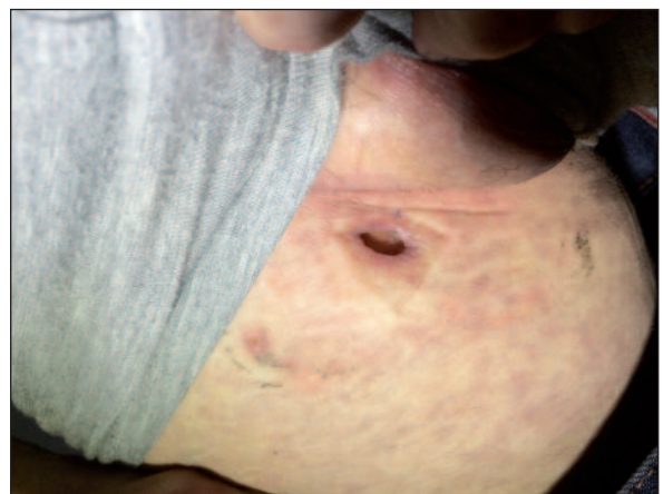
FIGURE 1b: Multiple ulcers on the medial bilateral gluteal areas.

(See color figure at http://www.turkiyeklinikleri.com/journal/dermatoloji-dergisi/1300-0330/ )