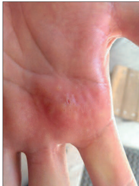
FIGURE 1d: Vesicular-ulcerative lesions on the distal pulp of the right thumb.

(See color figure at http://www.turkiyeklinikleri.com/journal/dermatoloji-dergisi/1300-0330/ )