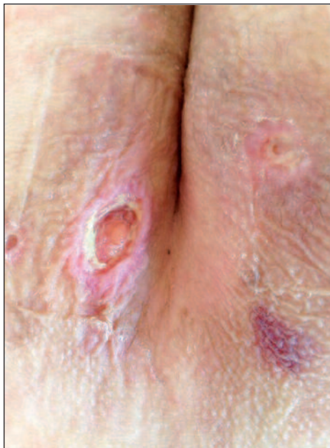
FIGURE 1c: Multiple dyshidrotic vesicular lesions on the palmar surface of the hands.

After the discontinuation of the RTX therapy, the methylprednisolone dose was increased to 16 mg/day. Prontosan Wound Gel X ® , a sterile, highly viscous hydrogel, was prescribed to treat the deep ulcer on the patient's abdomen and Ag Granuflex ® hydrocolloid wound dressings were also prescribed for the remaining ulcers. One month later, the ulcers had partially healed (Figure 3); therefore, the methylprednisolone dose was gradually reduced to 4 mg/day. After six months of follow-up, he had no further cutaneous ulcers. The patient was called for a follow-up after a year; unfortunately we were informed that he had died in another hospital following gastrointestinal bleeding.