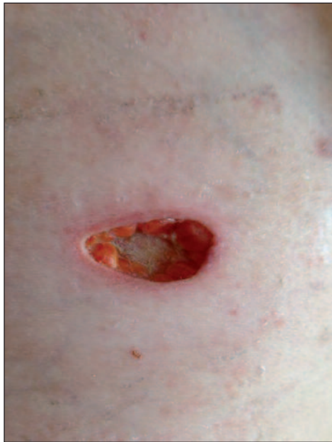
FIGURE 3: The partially healing ulcer one month after therapy..

(See color figure at http://www.turkiyeklinikleri.com/journal/dermatoloji-dergisi/1300-0330/ )