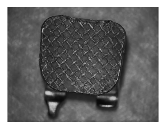
Figure 2. The base of each bracket was examined by stereomicroscope (Lumera T,Carl Zeiss AG,Oberkochen,Germany) at 20x magnification and an ARI score was determined according to the criteria defined by Artun and Bergland.<sup>19</sup>

Primary teeth are sometimes retained in adults due to impaction or hypodontia of the permanent teeth. <sup>20</sup> This phenomenon is reported at an incidence of 0% to 9%. <sup>21</sup> When primary teeth retained due to impaction of permanent teeth are recognized early, different treatments can be successfully implemented to assist eruption of the impacted permanent tooth. Especially with agenesis of the per-