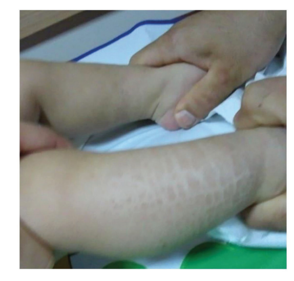
Figure 2. Ichthyotic plaques on the extensor surfaces of the lower extremities of one of the babies.

Prenatal USG was normal in all the cases. The cases we could not contact after pregnancy were uneventful