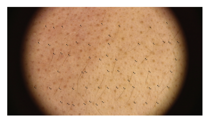
Figure 2. An example of counting hair with ImageJ program

irregularities. Ramot et al.<sup>5</sup> reported two cases, papulopustular rosacea and acne vulgaris, who had excessive hair growth on face after isotretinoin treatment. Hypertrichosis was reported in 2 of the 150 patients in a study by Karadag et al.6, evaluating the side effects of systemic isotretinoin. In the previous study, hypertrichosis disappeared after the treatment was discontinued, as in our patients. In a recent prospective study evaluating the effect of isotretinoin on hormones, 33% of the patients had menstrual irregularity and the hirsutism scores of 17% of the patients increased three months after the initiation of the therapy. Nevertheless, isotretinoin treatment was not found to have a significant effect on the insulin resistance, pituitary and adrenal hormones<sup>7</sup>. On the contrary, there are studies showing the use of isotretinoin which decreases ovarian volumes, and mFG score and reduces testosterone levels in patients with polycystic ovarian syndrome<sup>6,21,22</sup>. Unfortunately, the complex effect of isotretinoin on hair cycle physiology has not been elucidated yet in the mentioned studies.