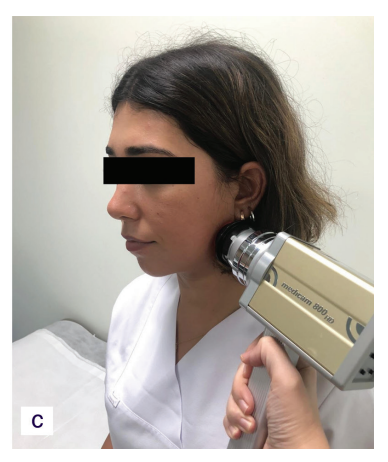
Figure 1. (a) Screening facial hair with dermoscopy, (b) Targeting chin, (c) Targeting gonion points of mandible