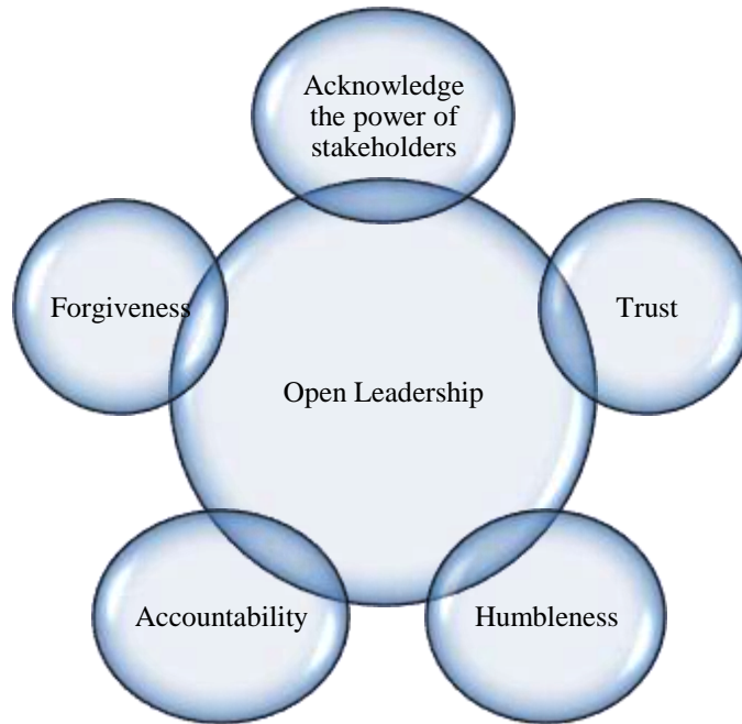
Figure 1: Main Characteristics of Open Leadership