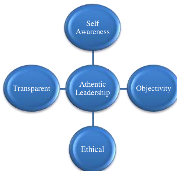
Figure 2: Four Dimensions of Authentic Leadership