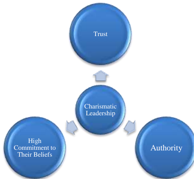
Figure 3: Three characteristics of Charismatic Leadership

Warren Bennis has identified four common characteristics in work which he used to describe the most influential and successful ninety leaders in America. These are the following: