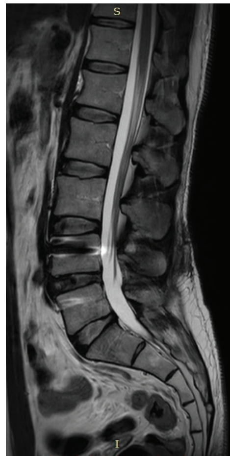
Figure 3. Annulus defect healed by making an inward fold

In subtotal discectomy, it is a known fact that the disc, which has been severely damaged after surgery, spontaneously fused in the long term. Another fact is that, the level of fusion over the years cause disruption of adjacent segments, therefore, we stabilise the patients with large annulus defects using the posterior transpedicular dynamic system. If the disc is not severely damaged, the annulus heals and the disc recovers itself, and in some cases rehydration may occur. In this case, since the movement is preserved, stress in the adjacent segment is reduced and adjacent segment degeneration risk