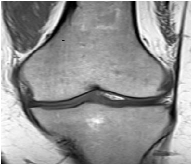
Figure 2. Coronal T1-weighted MRI of the knee in a 56-year-old nonsmoker woman with grade 4 bone marrow reconversion. (BMI:32, Hgb level:7.4 g/dL).

There were only two patients for statistically analysis of grade 4 (Figure 2,3).