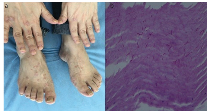
Figure 1. a) A psoriasis case presenting with onychomycosis in hand and foot nails, b) demonstration of fungal hyphae by the histopathological examination of the nail sample using periodic acid-Schiff stain

The data were collected by a physician in the relevant clinic, transferred to Microsoft Excel program, edited, cleaned, and made suitable for analysis. The Mann-Whitney U test, Spearman correlation and chi-