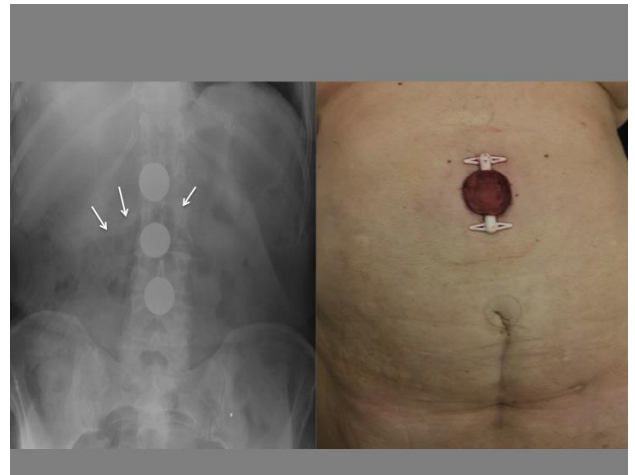
Figure 2. Plain abdominal graph shows the shadows of the coins, and gas in the transvers colon (white arrows) (on the left). The stoma is created where the second coin is located (on the right). The patient has an infra-umbilical midline incision

this incision and taken out of the abdomen with meticulous mobilization from its attachments particularly omental connections. The stoma is created over of loop ostomy rod. No additional incision or trocar insertion has been planned for these cases (Figure 2). If an additional incision or trocar insertion is necessitated in no-laparotomy group, it is defined as the failure of the technique.