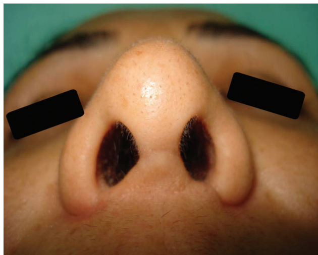
Figure 2. Columellar scar observed from the alar base.

NCSS (Number Cruncher Statistical System) 2007 and PASS 2008 Statistical Software (NCSS LLC, Kaysville, Utah) has been used for statistical analysis of the results. Descriptive (mean, standard deviation, frequency, median) and quantitative statistical methods were used in the evaluation of the study data. For quantitative analyses, the Mann-Whitney U-test was used to compare 2 groups with parameters that did not have a normal distribution, and the Kruskal-Wallis test was used to compare groups with parameters that did not have a normal distribution. Qualitative data were compared using the chi-square test. Statistical significance was accepted at a p level <.05.