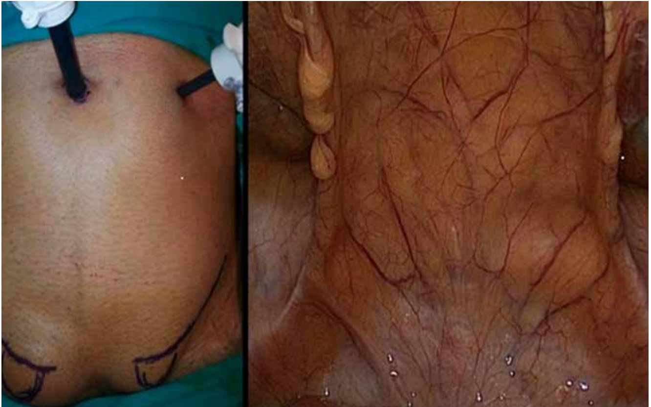
Figure 1: The view of bilateral inguinal hernia after the insufflation (on the left) and from the inside (on the right). (Arrows: medial umbilical folds, a: left inguinal hernia sac, b: right inguinal hernia sac)

lower abdominal laparotomy. Cases with huge hernia sac (some of Nyhus type 3b) or femoral hernia (Nyhus thpe 3c) were also excluded.