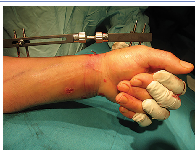
Figure 1. Postoperative evaluation of optimal reduction and distraction.

In the etiological evaluation, fractures occurred due to falling on the floor at home (n=5, 20%), on flat ground outside the home (n=9, 36%), and from height (n=6, 24%); traffic accidents (n=4, 16%); and direct trauma (n=1, 4%) (Table 1). Five (19.23%) patients had open fractures. According to the Gustilo–Anderson classification, fractures were classi-