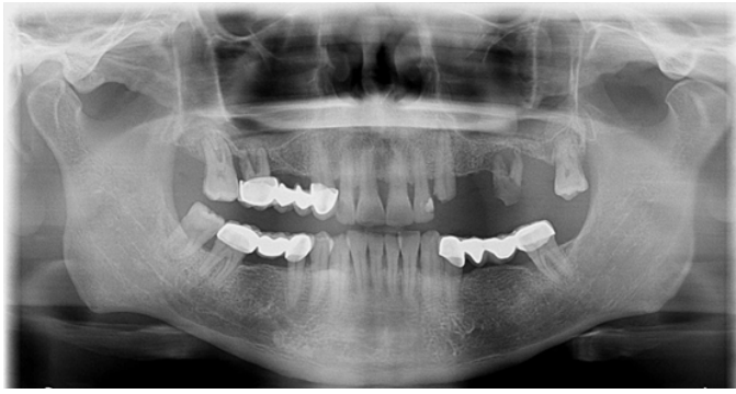
Figure 1. Preoperative panoramic graphy of the patient.

Systemic condition and maxillary sinus examination of the patient were symptomless. Bilateral lateral maxillary sinus lifting and onlay horizontal bone augmentation with otogenous mandibular symphysis block graft for the left posterior region were carried out under conscious sedation and local anesthesia. Patient was symptomless postoperatively but two months later, he referred to our department with a complaint of postnasal flow. At clinical and radiological examination, graft particles migrating from the right augmented site and antral polyp formation as well as maxillary sinusitis were observed (Figure 2a-b).