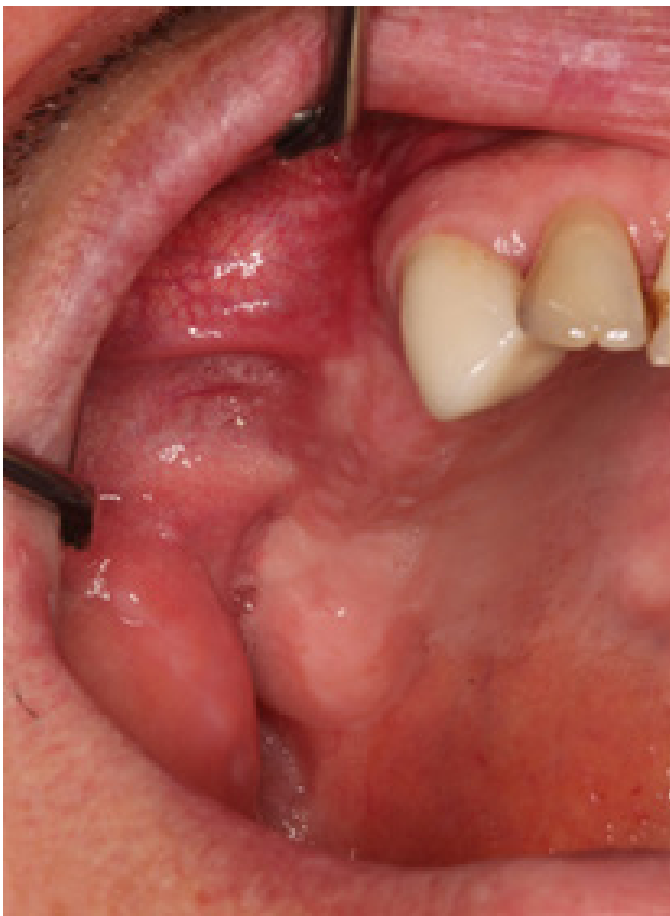
Figure 5. Postoperative view showing complete healing.