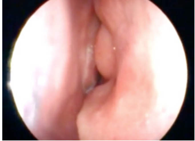
Figure 3. Intranasal endoscopic appearance.

fortunately, the same complaints consisted with OAF was observed again. Finally, we consulted patient's otolaryngologist. After diagnostic endoscopy and computed tomography, nasal septum deviation that restricts right maxillary sinus drainage was diagnosed (Figure 2-b and Figure 3).