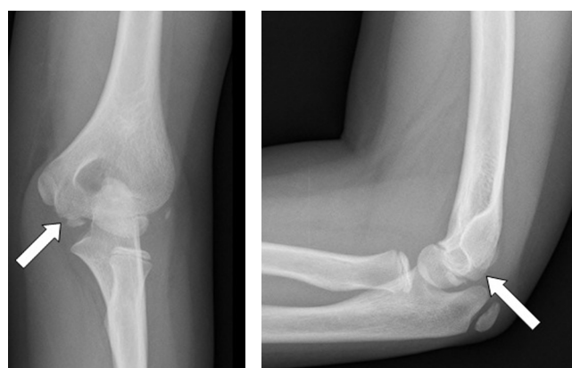
Figure 1. AP and lateral views of right elbow showing a slight radiolucent defect in the trochlear notch (A, B).

A right-handed 12-year-old boy had insidious onset of right elbow pain during daily activities for the last 3 weeks. No history of recent trauma, vigorous activity, and locking episode of the elbow joint were noted. There was no history of corticosteroid use and bone disease in his family. Physical examination revealed mild swelling and palpation induced tenderness on the medial epicondyle and 25° loss of active elbow extension. The carrying angle was 5° on the right and 13° on the left. There was no evidence of medial or lateral instability. Mental examination and laboratory data were within normal limits. Radiographs of the right elbow showed a slight radiolucent defect in the trochlear notch with well-defined margins (Fig.1). After usage of long arm splint for 2 weeks, persistence of the symptoms necessitated MRI of the affected elbow. The diagnosis of aseptic necrosis of the humeral trochlea was made by characteristic signal patterns of the magnetic resonance imaging. Avascular necrosis was traditionally seen as a geographic area that exhibited low signal on both T1- and T2-weighted images (Fig.2). Fluid collection was also noted in the radiohumeral joint. After the diagnosis, a long arm splint was applied for further 2 weeks. 2 months after removal of the splint, motion pain of the elbow joint disappeared and a full range of movement was achieved at 6 months after his first visit.