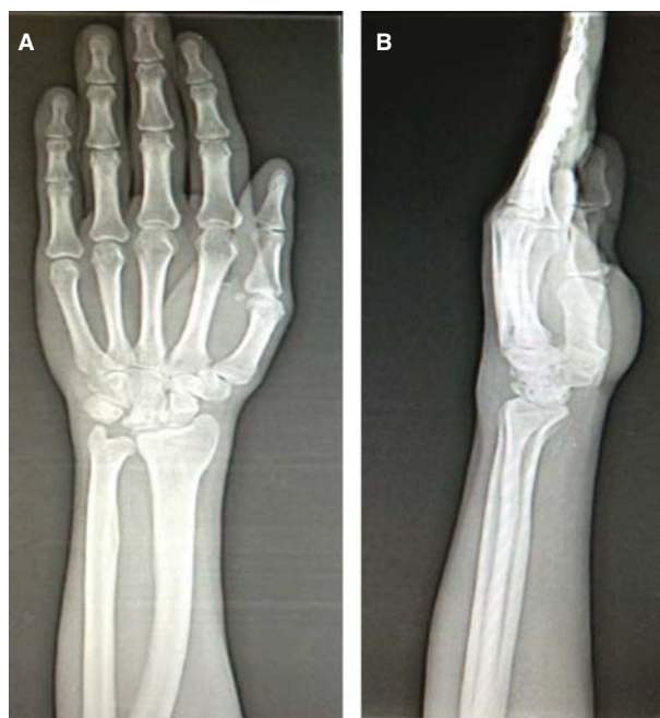
Figure 4. X-rays at second year of the operations showing the lunate to be in reduced position but has been collapsed ( a and b ).

was successfully reduced. After anatomical reduction was achieved, fixation was applied using K-wires. A fluoroscopic control revealed normal carpal bone relationship, and both volar and dorsal capsules were repaired (Figure 2). A short arm cast was applied for 8 weeks. Three months postoperatively, all K-wires were removed, and physiotherapy