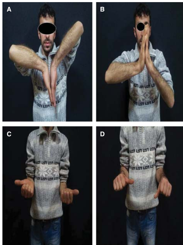
Figure 3. Clinical photos showing the functional results of the patients at second year postoperatively ( a , b , c , and d ).

was successfully reduced. After anatomical reduction was achieved, fixation was applied using K-wires. A fluoroscopic control revealed normal carpal bone relationship, and both volar and dorsal capsules were repaired (Figure 2). A short arm cast was applied for 8 weeks. Three months postoperatively, all K-wires were removed, and physiotherapy