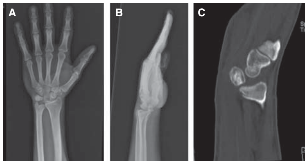
Figure 1. Preoperative X-rays ( a and b ) and CT scan ( c ) showing volar dislocation of the lunate bone.