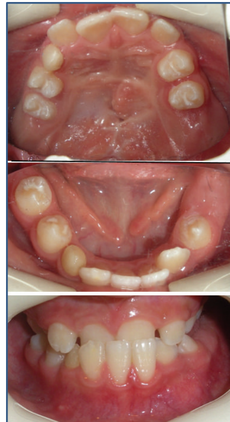
FIGURE 6: Intraoral appearance of the patient after treatment.

The differential diagnosis of Nager syndrome is done with Treacher-Collins, trisomy 18, Pierre-Robin, and Goldenhar syndrome. The craniofacial features of Nager syndrome resemble Treacher-Collins syndrome, including micrognathia, malar hypoplasia, downslanting palpebral fissures, and ear anomalies but mandibular hypoplasia is more severe in Treacher-Collins syndrome. Nager syndrome can be distinguished from Treacher-Collins syndrome by preaxial upper-limb deformities, such as thumb anomaly, radial defect, and radioulnar synostosis. The facial features and upper-limb anomalies are diagnostic for Nager syndrome. Trisomy 18 is usually associated with clinodactyly, not with absence of digits [1, 6]. In this case report, the patient had exactly similar features with Nager syndrome.