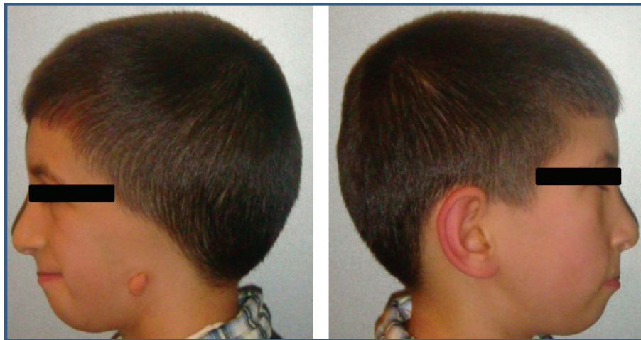
FIGURE 2: Lack of development of the internal and external ear with related hearing problems and severe mandibular hypoplasia with retrognathia.

mother and healthy father at 40 weeks of gestation. The pregnancy of mother was uncomplicated. The mother's history regarding alcohol, smoking, and drug abuse was negative. Family history was not noted regarding craniofacial disorder. He has two normal sisters. A diagnosis of Nager syndrome was made around the age of 2 years when facial and limb anomalies became obvious.