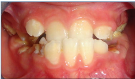
FIGURE 5: Abnormal overbite with overlap of the upper teeth.

sisters. In perinatal period, abnormality was diagnosed with ultrasonography but his family preferred to continue with the pregnancy. He uses nasopharyngeal airway when sleeping due to oropharyngeal airway narrowing observed at birth.