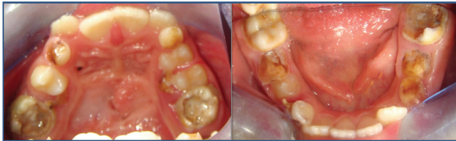
FIGURE 4: Intraoral findings, numerous carious teeth (#16, #55, #53, #26, #65, #63, #36, #75, #74, #46, #85, #84, and #83), hypomineralisation (#16, #26, #36, and #46), and cleft palate were seen.