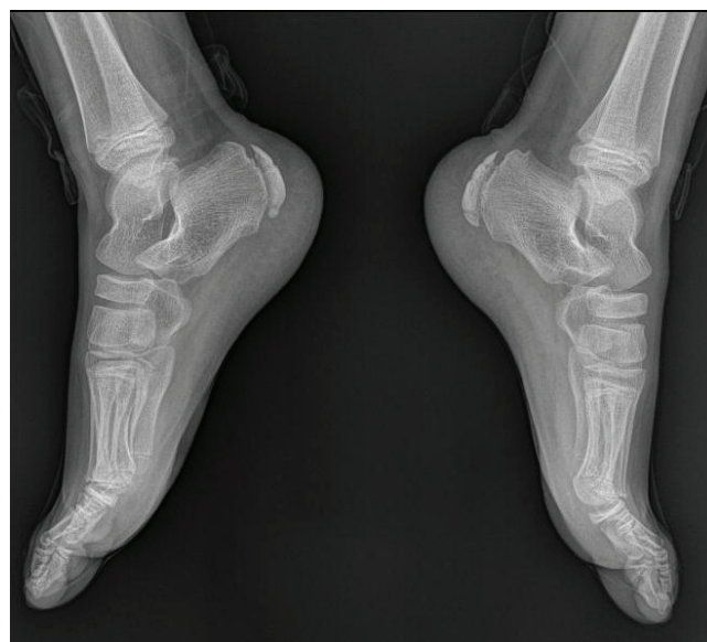
Figure 1. Lateral calcaneus X-ray graphy of a 10-year-old boy with bilateral heel pain.

There were 31 patients in 2014, 19 in 2015, 11 in 2016, and 21 in 2017 who were diagnosed with Sever's disease (Figure 1). Of 74 patients who were diagnosed with Sever's disease, 59 were boys and 15 were girls. The mean age of the patients was 10.77 (6.87-15.73) years. The mean age of boys was 11.14 (8.04-15.73) year, while that of girls was 9.28 (6.87-13.20) years. It was found that the disease was seen in girls relatively younger than boys ( p = 0.00116 ). Symptoms were bilateral