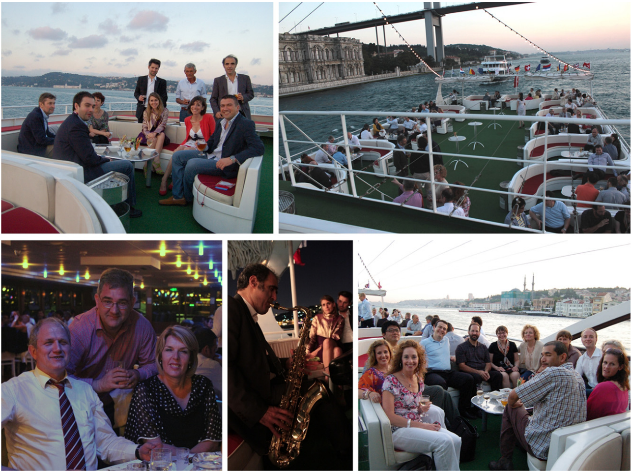
FIG. 7. Boat trip and dinner between Asia and Europe and special performance by Professor Emre Belli.