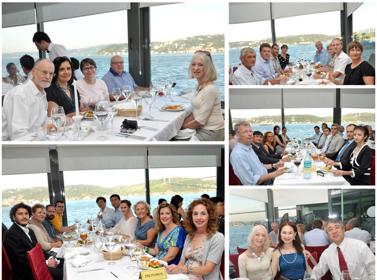
FIG. 6. Faculty dinner at the University of Istanbul's social club on Bosphorus.

The program committee members decided to add two new young investigator awards for the Istanbul meeting in honor of two pioneers' lifelong contributions to artificial organs.