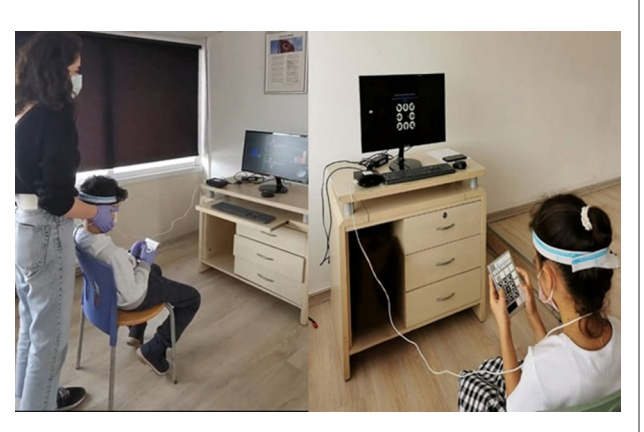
FIGURE 1 Set up of the f-HIT performed in a special education and rehabilitation center.