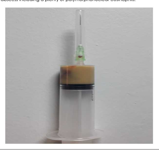
Figure 3. Macroscopic appearance of the material compatible with abscess including a plenty of polymorphonuclear eosinophils.

All lymphadenopathies were improved. The patient has been doing well and no recurrence has been observed for six months.