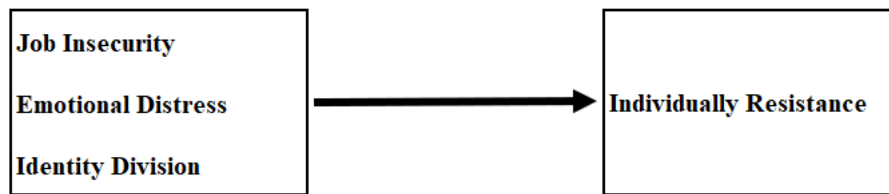
Figure 1. Factors Affecting Individually Resistance