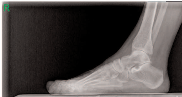
Figure 2 — Preoperative lateral weight-bearing x-ray radiography of a 62-year-old woman.