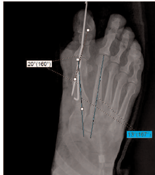
Figure 3 — Postoperative antero-posterior x-ray radiography of the same patient. The hallux valgus angle improved by 20° and intermetatarsal angle improved by 13°.