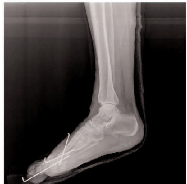
Figure 4 — Postoperative lateral x-ray radiography of the same patient.

session. This scoring system consists of three main categories, namely pain, function, and alignment, scored from 0 to 100, with higher scores indicating better functions (10). The pain and function sections were answered by the patient.