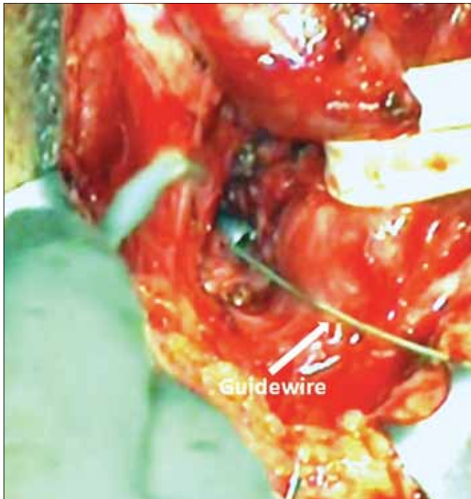
Figure 1. View of a guide wire passed in an antegrade manner through a cystoscope and pulled out from the perineal side

neous). In these cases, fistula repair was performed along with end-to-end anastomosis.