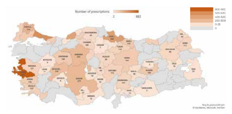
Figure 1. Number of abuse prescriptions by province

All drugs taken by abusers for approximately 4 years (17.3.2017-31.12.3020) are limited according to ATC group and active substance name and code. Benzodiazepines are followed by opioids, followed by pregabalin, Considering that pregabalin is not a drug group but only an active ingredient, abuse seems to be much greater.