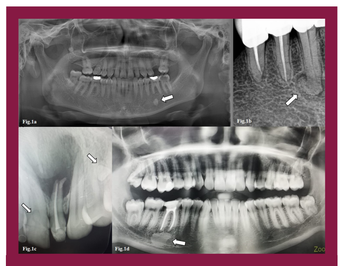
Figure 1. A composite figure of commonly seen radiopaque lesions is given in Figure 1. Fig.1a) An example of idiopathic osteosclerosis; Fig.1b) An example of cementoosseous dysplasia; Fig.1c) An example of odontoma and pulp stone; Fig.1d) An example of condensing osteitis

Cementoblastoma was seen in 1 (0.05%) patient; 1 (0.1) female and 0 (0.1%) male. There was no statistical difference between men and women in terms of cementoblastoma (p>0.05) (Graphic 1 and Table 1).