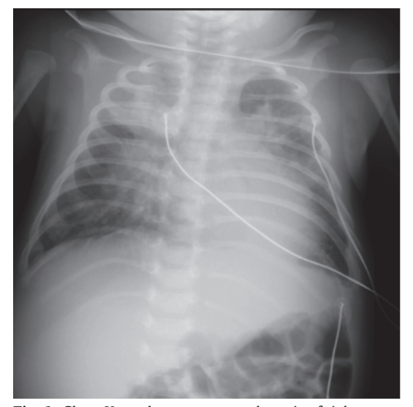
Fig. 1. Chest X-ray demonstrates atelectasis of right upper lobe and bilateral diffuse infiltrations of the lungs