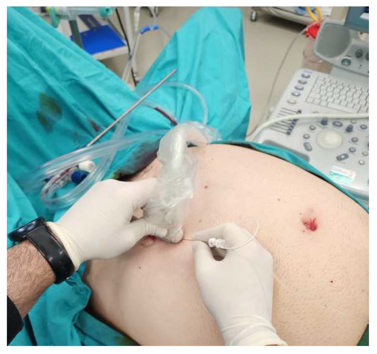
Figure 2 Patient and probe position during M-TAPA.

continuous variables (demographic data and duration times of surgery and anesthesia, and QoR-40). The Mann-Whitney U test was used for data without normal distribution (NRS). The statistical significance threshold was p < 0.05. Bonferroni correction was used for the analysis of NRS. Statistical significance was adjusted to p < 0.0083 due to measurements from six time points.