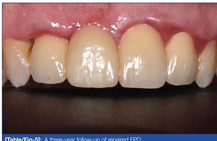
[Table/Fig-5]: A three-year follow-up of repaired FPD.

The FPD and the ceramic veneer intraoral repair survived for 3 years to this date [Table/Fig-5]. Marginal integrity, marginal discoloration, anatomical form, restoration colour stability and periodontal health were evaluated after three years. All of the criteria were acceptable except periodontal health. The patient was motivated about tooth brushing and dental floss use.