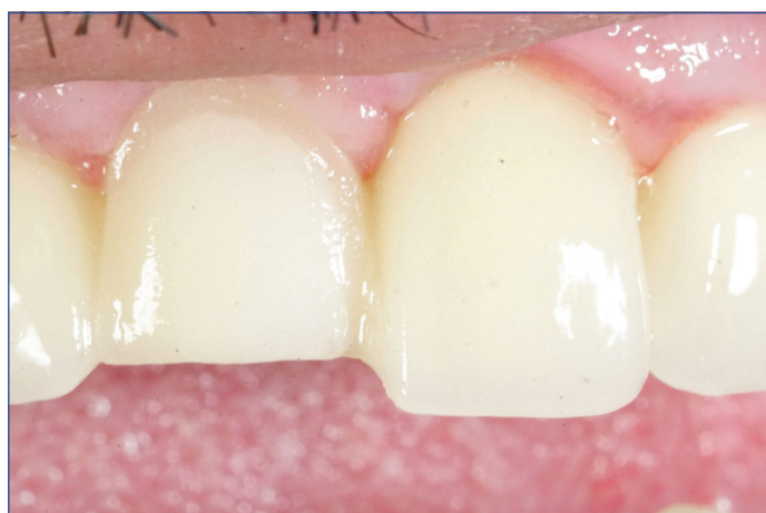
[Table/Fig-2a]: Close-up view of preparation.

After the completion of the preparation, the impression was taken via additional type elastomeric impression material (Elite H-D, Zhermack, Germany). The porcelain veneers were fabricated using a leucite-reinforced glass-ceramic (IPS Empress E.max, IvoclarVivadent, Schaan, Liechtenstein) [Table/Fig-3].