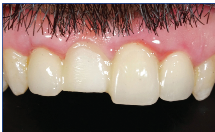
[Table/Fig-2b]: Prepared porcelain in tooth 11.

A light curing gingival barrier (OpalDam, Ultradent) was applied to protect the periodontal tissues. The porcelain surface and inner surface of the laminate veneer were etched with 9.5% Hydrofluoric (HF) acid (Ultradent) for one minute, washed, and dried. Silane (Monobond N, IvoclarVivadent, Liechtenstein) was applied to both surfaces with microbrush and waited for one minute. A thin layer of bonding (Heliobond, IvoclarVivadent, Liechtenstein) was applied and light cured for 20 seconds. It was cemented with Variolink N