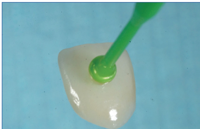
[Table/Fig-3]: Ceramic veneer etched with HF acide, washed and dried.

LC (IvoclarVivadent, Liechtenstein). Residual cement was removed. The polymerisation was completed with the application of additional 40 seconds of light curing [Table/Fig-4]. As the patient had tooth wear in lower anterior incisal surfaces and posterior occlusal surfaces (bruxism), a stabilisation splint was made and the patient was recommended to use it during sleep.