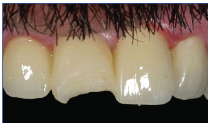
[Table/Fig-1]: Patient presents chipping at the incisal area of veneered zirconia fused to multiunit zirconia bridge at tooth.

A 38-year-old male patient visited a private dental office with complaints about the fracture that occurred two days ago, in a four-unit porcelain veneered zirconia FPD, which was delivered one-year-ago. The FPD was located between upper right and left second incisors. After the oral examination, it was observed that the fracture was in the ceramic fragment of the right central incisor [Table/Fig-1]. All treatment options regarding the porcelain chipping (porcelain fracture without zirconia framework exposure) were explained to the patient. The patient refused to renew his FPD due to clinical time and cost. Patient approved of ceramic veneer, as it would be more aesthetic than to repair with composite resin.