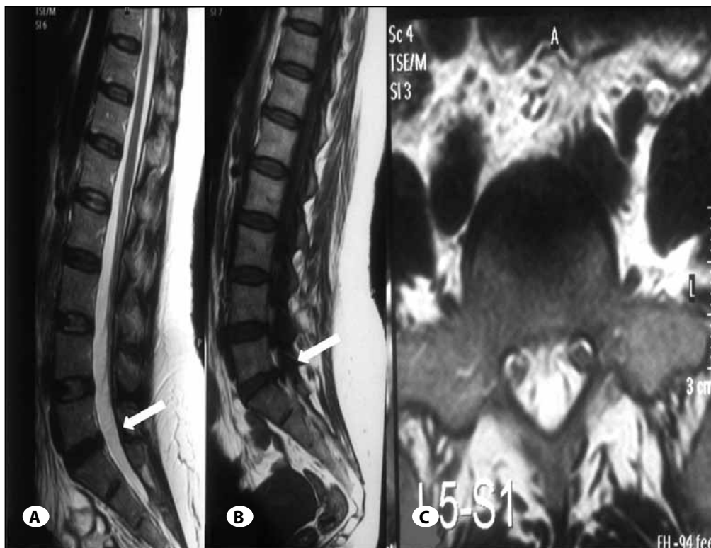
Figure 1: A) T2 weighted sagittal, B) T1 weighted sagittal, C) T2 weighted axial MR images show L5-S1 disc bulging (December 2008).

We also suggested rest and referred her to a dietitian. The patient had been encouraged to see an endocrinologist, at which time type 2 diabetes mellitus was diagnosed after laboratory tests. Thereafter, metformin HCL (Matofin, Sanovel Drugs) 500 mg was prescribed, and she lost 25 kg in 10