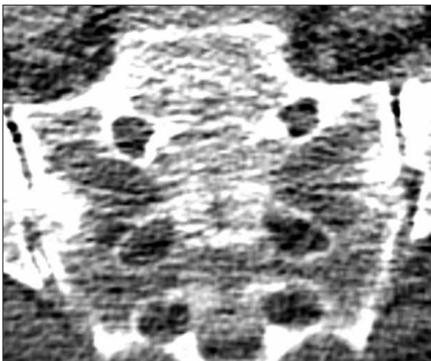
Figure 1: Preoperative sacroiliac joint CT shows the presence of the osteophyte within the sacroiliac joint.

The pain pattern was evaluated clinically. Tenderness to the sacroiliac joint palpation and percussion, and positive response to sacroiliac tests (i.e., FABERE and Gaenslen) were evaluated in favor of SIJD. The sacroiliac joint was evaluated radiologically using CT and MRI to determine the existence of degeneration in the sacroiliac joint, osteophytes and sclerosis. In cases suspected of having SIJD, the diagnosis was supported by a