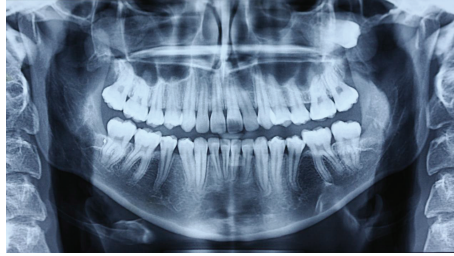
FIGURE 1: A panoramic radiograph revealed that the left maxillary third molar was displaced in a posterosuperior direction.

The granulation tissue around the tooth was removed and the tooth was extracted. Maxillary sinus and deep layers were irrigated with %0.5 saline solution and with Rifocin. The incision was primarily closed. No complication occurred postoperatively after 1 year of followup.