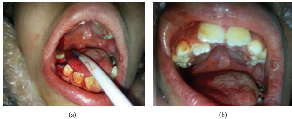
FIGURE 4: Newly decayed teeth were observed and a new treatment plan was established for second session of moderate sedation.

full-consciousness situation [2]. General anesthesia and deep sedation was observed as an effective dental treatment option for these types of patients who have involuntary movements. Also, hear loss and cataract are other rough factors to communicate with the patient.