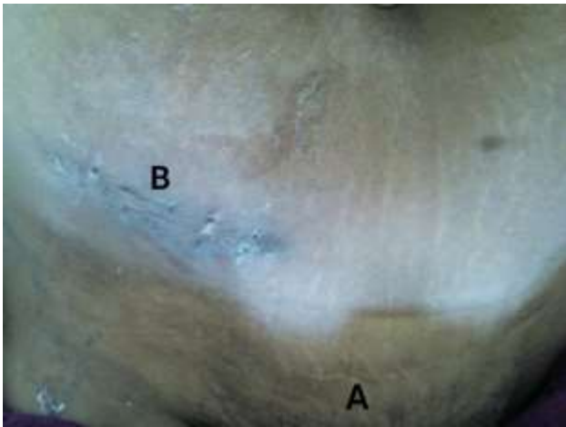
Figure:1 A: Pfannensteil scar of previous caesarean section; B: gridiron scar for excision of nodule.

Fine needle aspiration cytology of nodule revealed mature adipose tissue without any specific pathology and suggested diagnosis was Benign lesion possibly Lipoma.